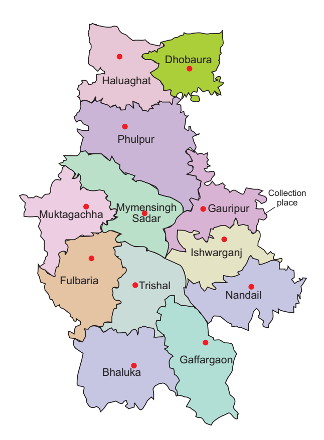
Fig. 1. Study area.

30 fishes were used in this study. The size was ranged from 5.3-7.3 inch and weight was ranged from 50-90 g. Moisture and ash contents of the fish were determined by AOAC method (1990). The crude protein was conducted by Micro- Kjeldhal method (Pearson, 1999).