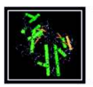
Protein of TPO gene