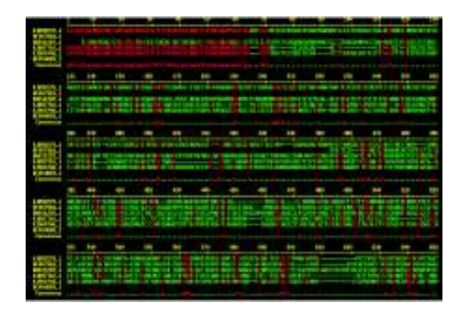
Fig. 1. The image of multiple allignment of genes from multialin tool.

For the multiple alignment second tool which is used are alibee mutiple alignment and results are given in Fig. 1. A phylogenetic tree is a branching diagram or "tree" showing the inferred evolutionary relationships among biological species about their phylogeny, based upon similarities and differences in their physical or genetic characteristics. Genes BC054883.1, DQ011222.1 and AF267981.1. They show close similarity to each other in phylogeny. KJ900706.1 and KJ897710.1 show close similarity in phylogenetic tree. Fig. 2A and B. Thyroid hormones have significant role, in homeostasis in mammals, growth and development. Nucleotide scoring distance matrix shown in Fig. 3 are used in phylogeny as non-parametric distance methods and were originally applied to phenetic data using a matrix