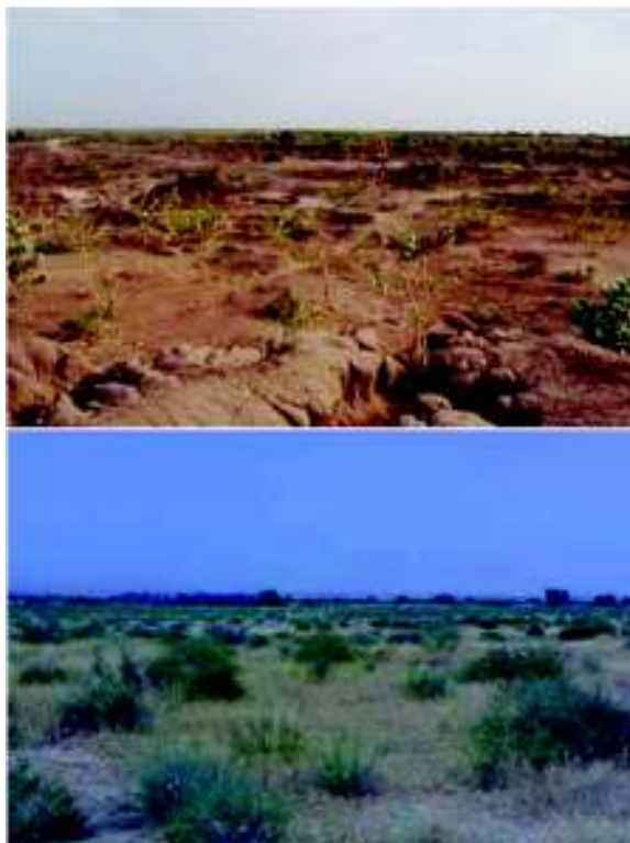
Fig. 2. Degraded rangelands.