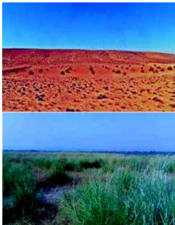
Fig. 3. A view of seeded and unseeded area of Rakh Shadan Lund rangeland (Sarfranz et al. , 2012; Islam et al. , 2008; Hussain and Durrani, 2007).